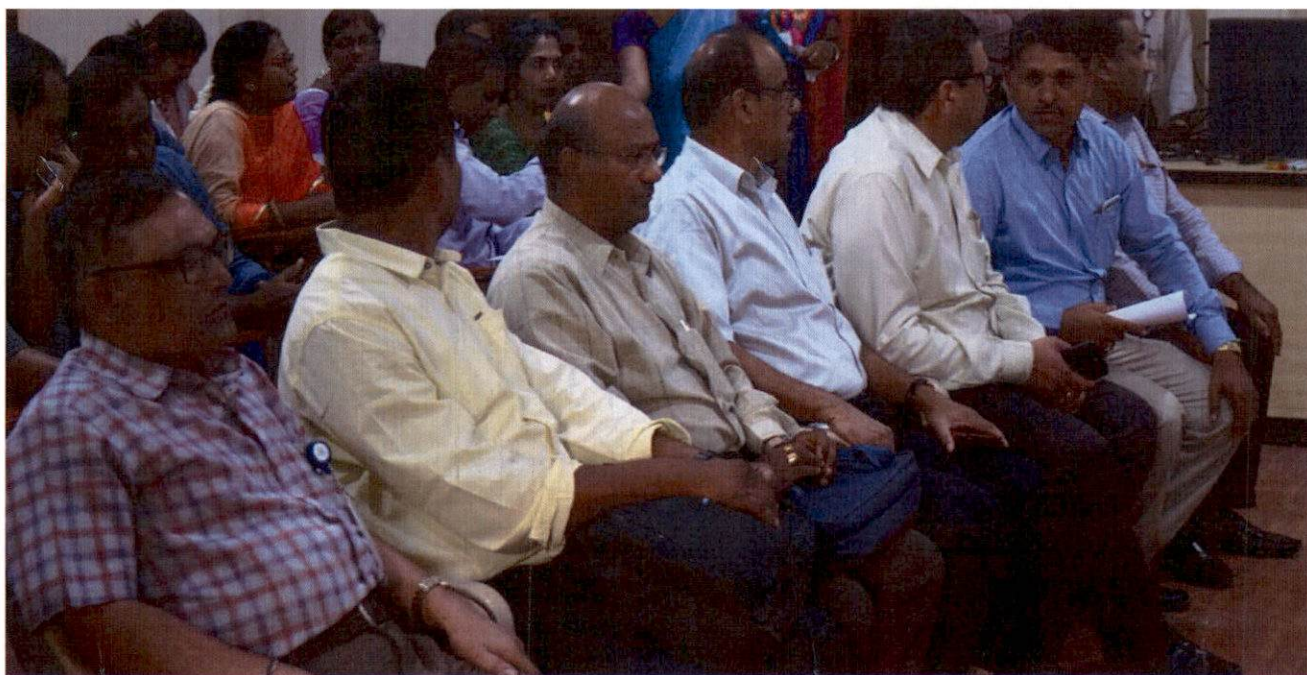
Celebrations of Babu Jagjivan Ram Jayanthi on 05/04/2017